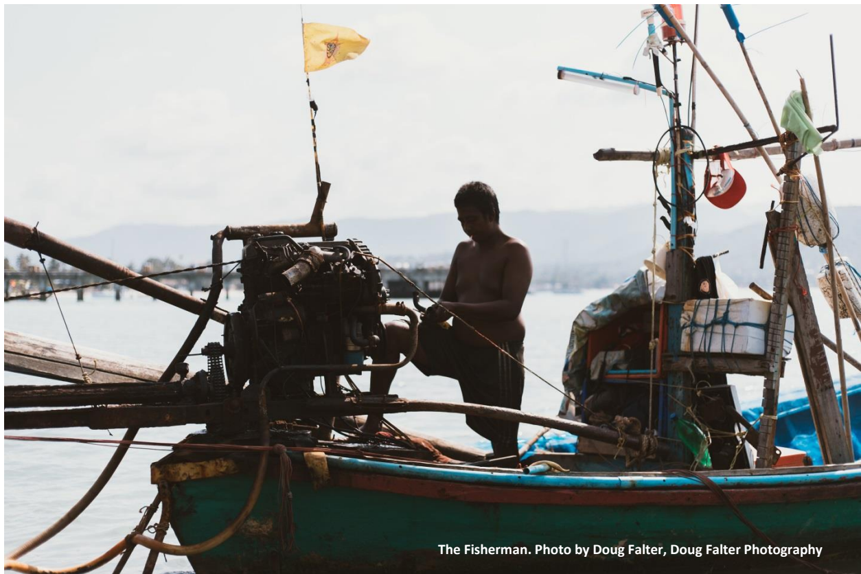
The Fisherman.

One of the most confounding challenges—rather a confluence of factors that science has yet to fully understand— is climate disruption, and how it impacts agriculture, aquaculture and public health. Islands are affected more than other regions since their geography is static and island-dwellers can't migrate to avoid desertification or flooding; you might say they're the canaries in the climate change coal mine. Each season they experience progressively more violent typhoons, cyclones and hurricanes while sea levels and water temperatures are rising. Pests, diseases and fish are suddenly behaving in different ways. Because fewer can grow what they consume, more is imported, and at a higher cost.