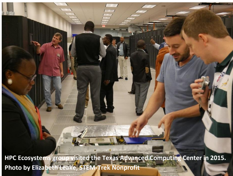
HPC Ecosystems group visited the Texas Advanced Computing Center in 2015.

Each Ecosystems center is supported by tech generalists who maintain the hardware, install and upgrade software and teach others how to use it. Unfortunately, most wear so many hats that there isn't time at the end of their day to plan for the future. Since the hardware is older, it won't last forever; it's therefore urgent that they begin to frame a case for greater