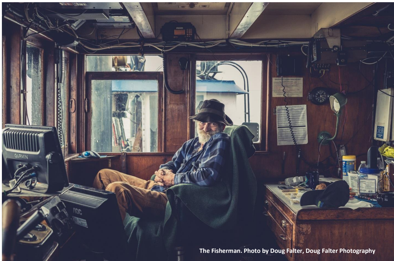
The Fisherman.